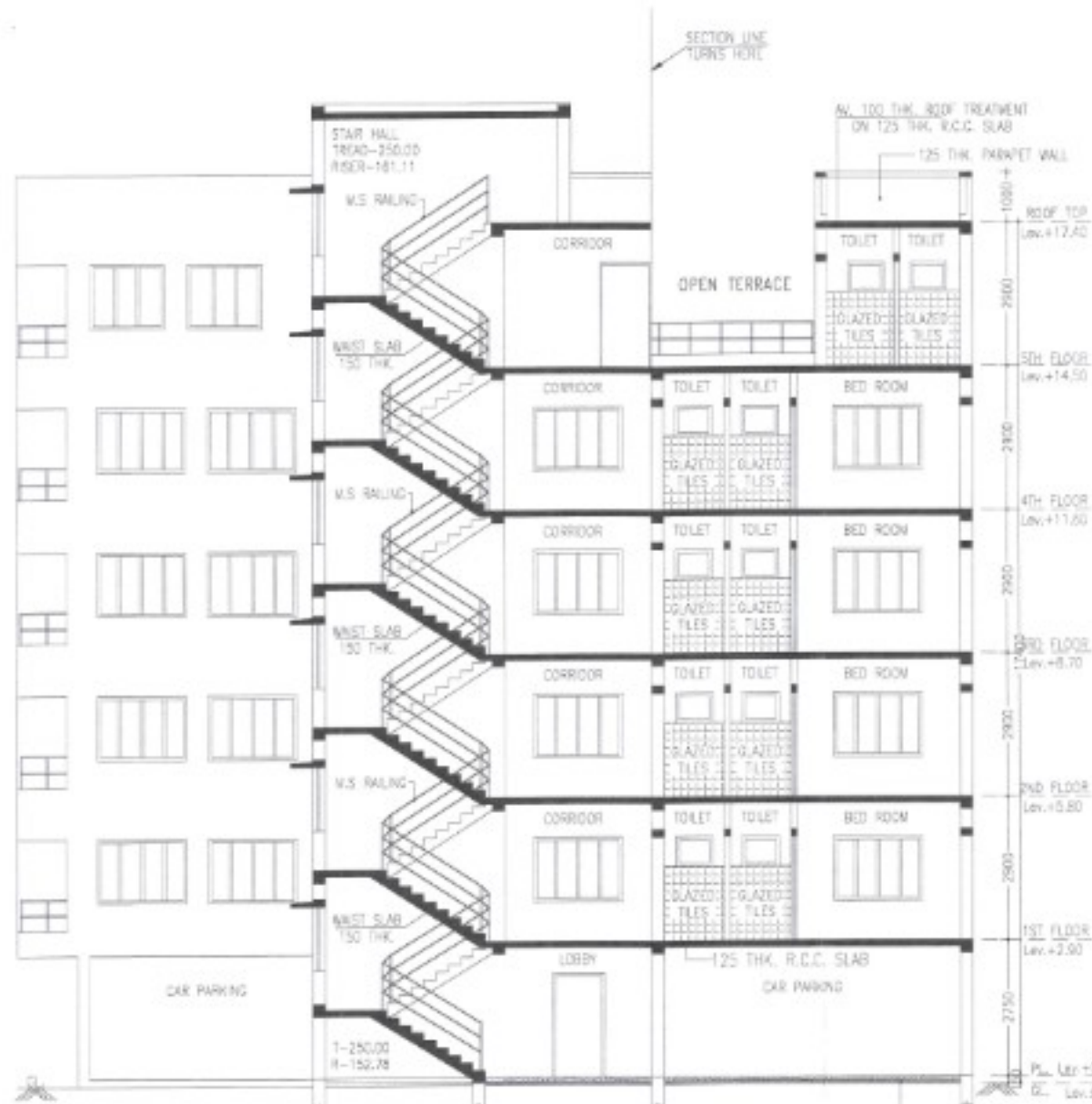
BLOCK-3 SECTION A-A SCALE-1:100